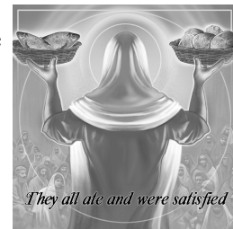
They all ate and were satisfied

Reflection: Jesus is mourning the death of John the Baptist. He leaves by boat to get a little 'alone time'. The crowds follow him because they are drawn to his message. Despite his personal sorrow, Jesus is moved with pity and ministers to the crowd. He even goes beyond healing the sick and feeds thousands with a mere 5 loaves and 2 fish. There are even leftovers!