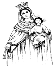
Our Lady of Mount Carmel

Due to the current public health emergency, our parish office is closed. We are here still here to assist you by phone, 805/969-6868 or email at info@mtcarmelsb.com .